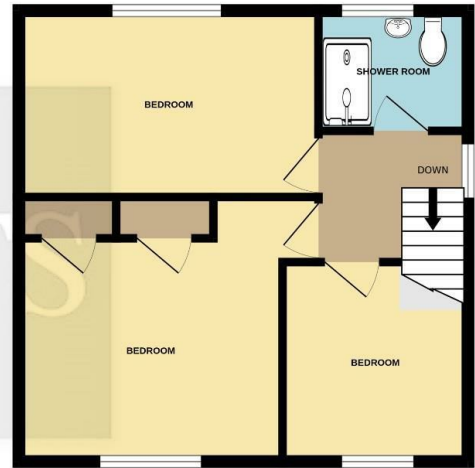
1ST FLOOR 429 sq.ft. (39.9 sq.m.) approx.